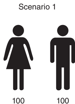
Figure 2.2 Two people on a desert island

In Scenario 1, imagine that there are two people alone on a desert island. It isn't a paradise; there's limited food, water, and shelter, and the two people have to struggle for survival. But suppose that nonetheless they are reasonably happy. Let's say that each person has a total of 100 units of